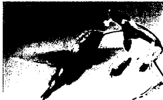
Data from the Experiment